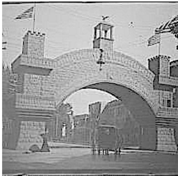
Vermont Centennial Arch at four corners in Bennington, Vermont, 1891.

No Commission members have been announced yet, so how Bennington will be represented remains to be seen. Given the town’s connection to Ethan Allen and the Green Mountain Boys as well as the presence of a State Historic Site (the Monument, of course) commemorating the Battle of Bennington, it is expected that one or two commissioners from the town will be named.