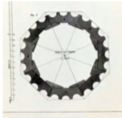
Half of Plate XXIV, titled "Glueing up of Columns" in The Architect, or Practical House Carpenter , by Asher Benjamin, 1830.

Long wooden shafts, 2" thick minimum, with their sides cut at angles so that, when they are set side by side, they join in a circle. After three flutes are carved in each shaft, they are fastened together on the inside with angled blocks and hide the glue.