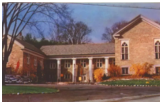
Bennington Museum today. Note original Church structure and windows on the right.

The church continued to serve the Catholic community until the congregation outgrew the old church and, in the late 1880s, discussion was underway to build a new, larger church. The church was vacant from around 1892 to 1923 when it was sold to the Historical Society. It opened to the public in 1928 as the Bennington Historical Museum. In 1954, the name was changed to The Bennington Museum. Today, the name is simply, Bennington Museum. (See https://benningtonmuseum.org/about/the-museum-then-and-now/ )