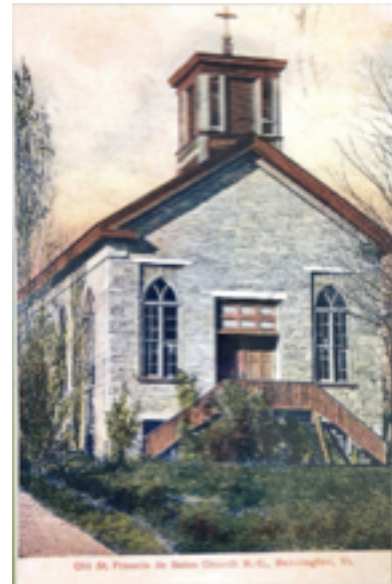
Old St. Francis de Sales Church

St. Francis de Sales was the first Catholic church in southern Vermont. The Gothically designed church, built of local stone, was topped by a wooden belfry and cross and had a seating capacity of 400. It was said to be one of the most beautiful churches in the area. In 1857, land was purchased for a cemetery behind the church. In 1862 the church was expanded with the addition of a 25-foot vestry to the northwest side.