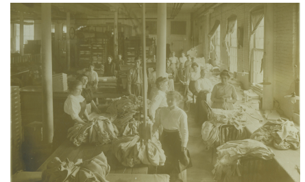
FINISHING ROOM AT THE H.E. BRADFORD MILL

Object: Negative, Glass Plate Date: 1894-898 Catalog Number: 2015.6.979