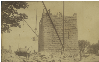
BENNINGTON BATTLE MONUMENT UNDER CONSTRUCTION

All photographs in the Museum's collection are available through our online database. You can see Wills White's and Madison Watson's glass plate negatives from the Weichert-Isselhardt Collection and vintage photographs below.