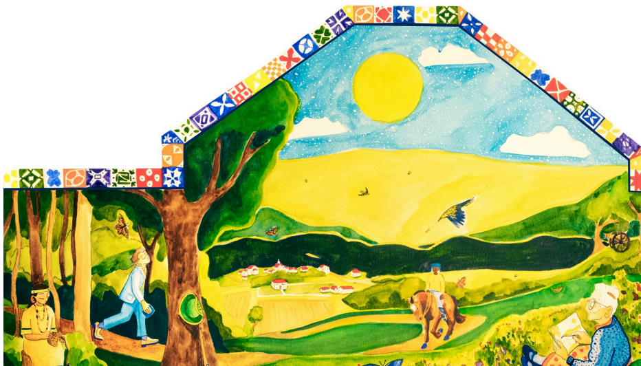
*proposed mural on the Museum's southface by Erin Bundock